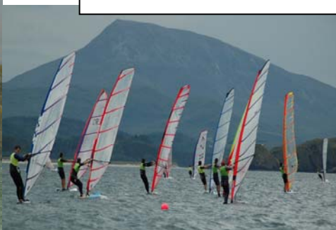
Racing in front of Muckish 2006