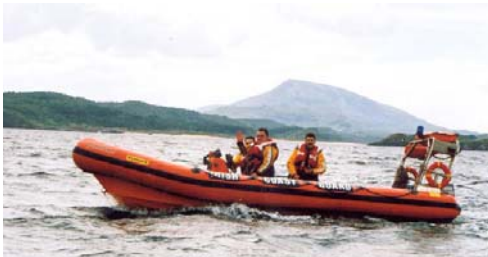
Thanks to the rescue crew for their support and professional assistance.

If there is sufficient racing on Saturday then Sunday will become a fun day. This will be notified to entrants at 2.00pm on Saturday.